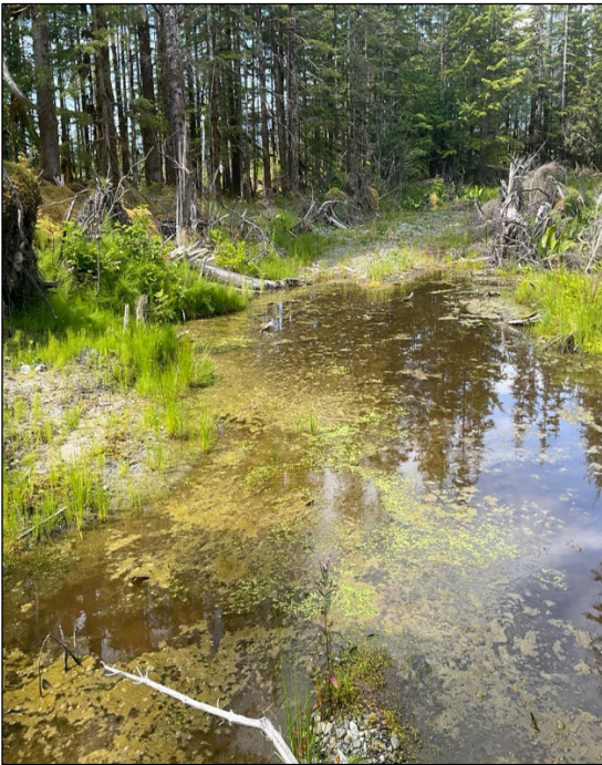
Figure 2.—Stream crossing the road at waypoint 660.