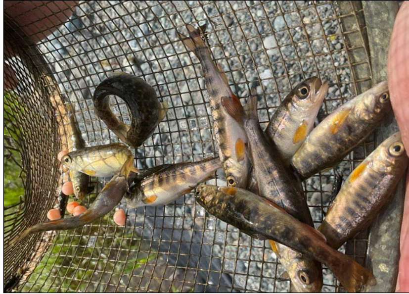
Figure 1.—Juvenile coho salmon caught at waypoint 657.