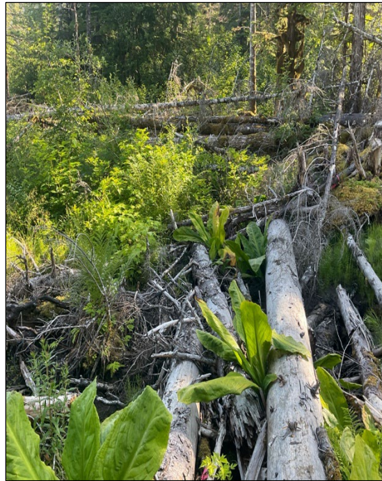
Figure 3.—Slash covering part of the stream at waypoint 656.